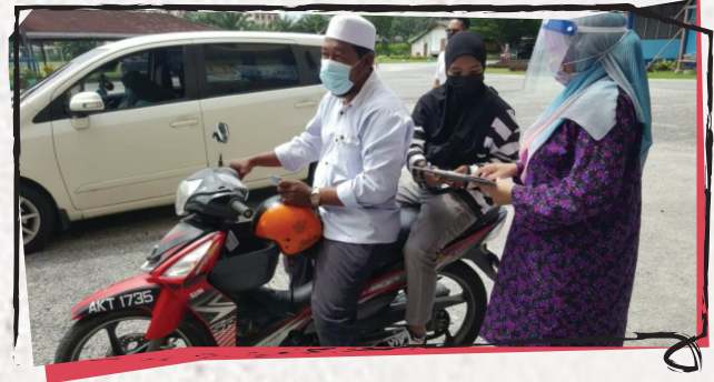
Laptop distribution in SMK Dato' Sagor, Perak