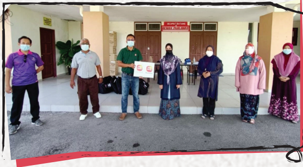
Device handover to SMK Dato' Lela Pahlawan by YSD