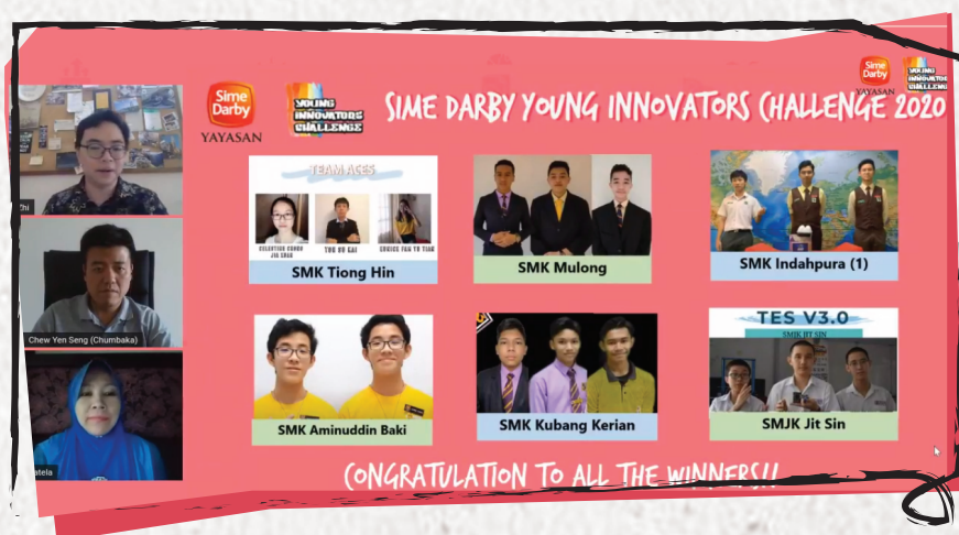
Group Photos of SDYIC Winners