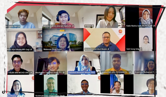
An online engagement session between scholars and the Sime Darby Berhad Human Resources team